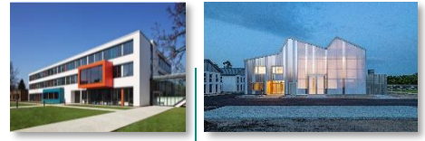
Institute for Automation and Applied Informatics (IAI)